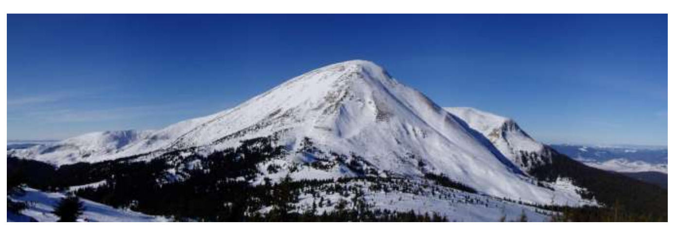
Petros peak 2020m