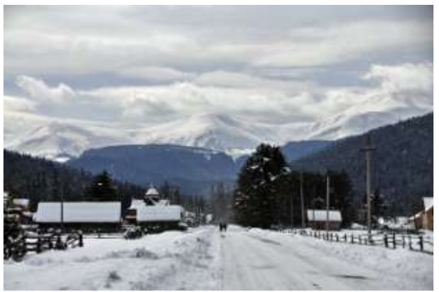
Downhill in Hoverla region