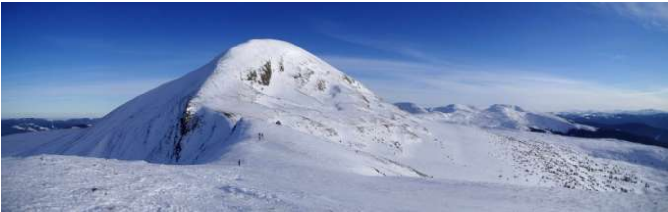
Hoverla peak 2061m