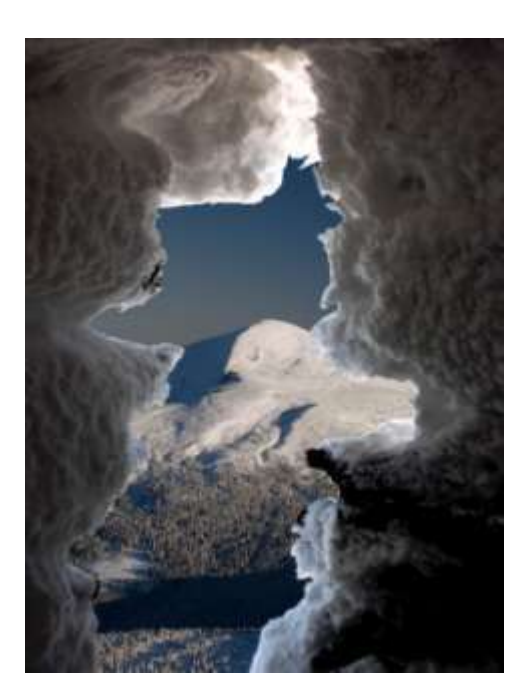
Hoverla peak 2061m