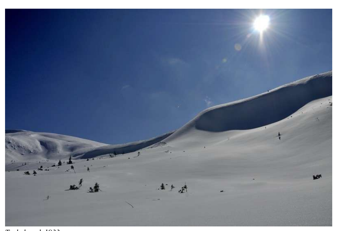
Turkul peak 1933 m